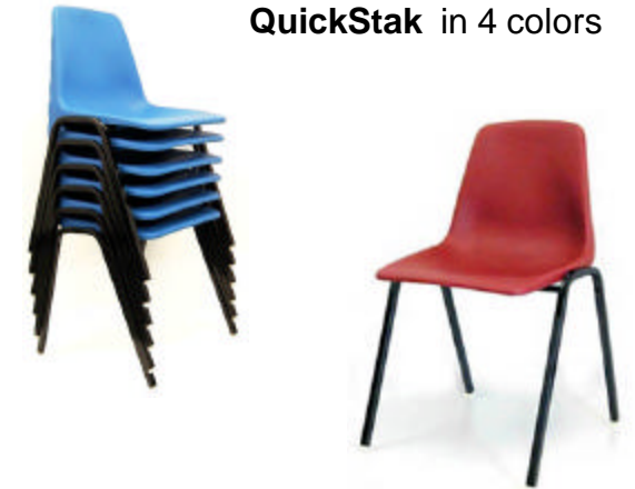
QuickStak in 4 colors