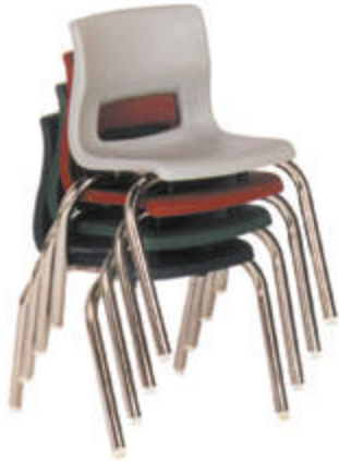
ErgoStack in 5 sizes and 12 colors