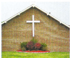
8' Square Aluminium