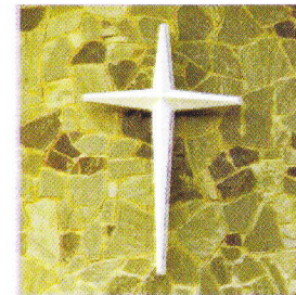
Sunburst Wall Cross