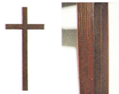
Old Rugged Cross High Quality Wood-like Finish